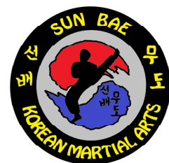
TAEKWONDO - HAPKIDO - KUMDO