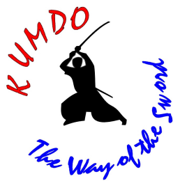
AUSTRALIAN KUMDO SOCIETY